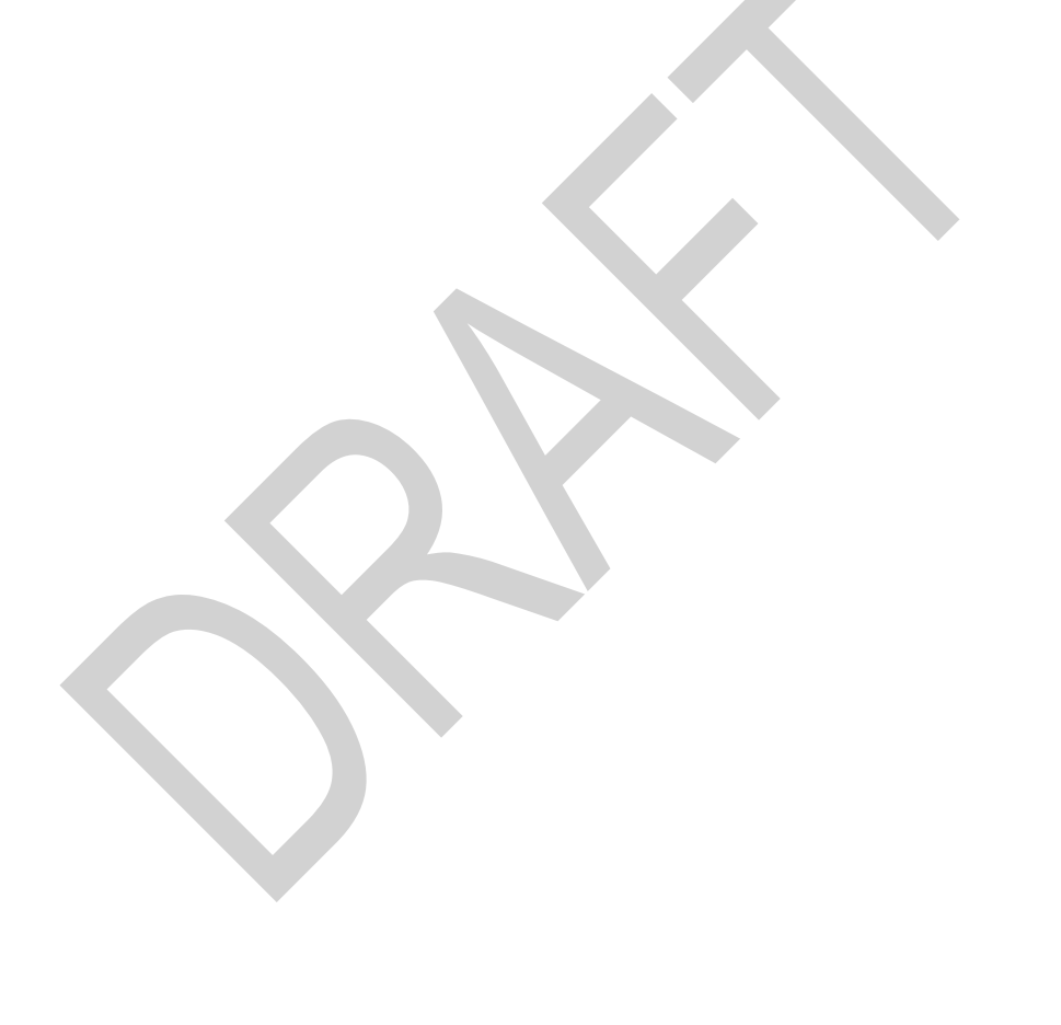
Page 45 of 48